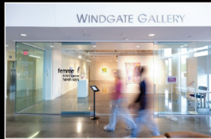
Visit the Windgate Gallery