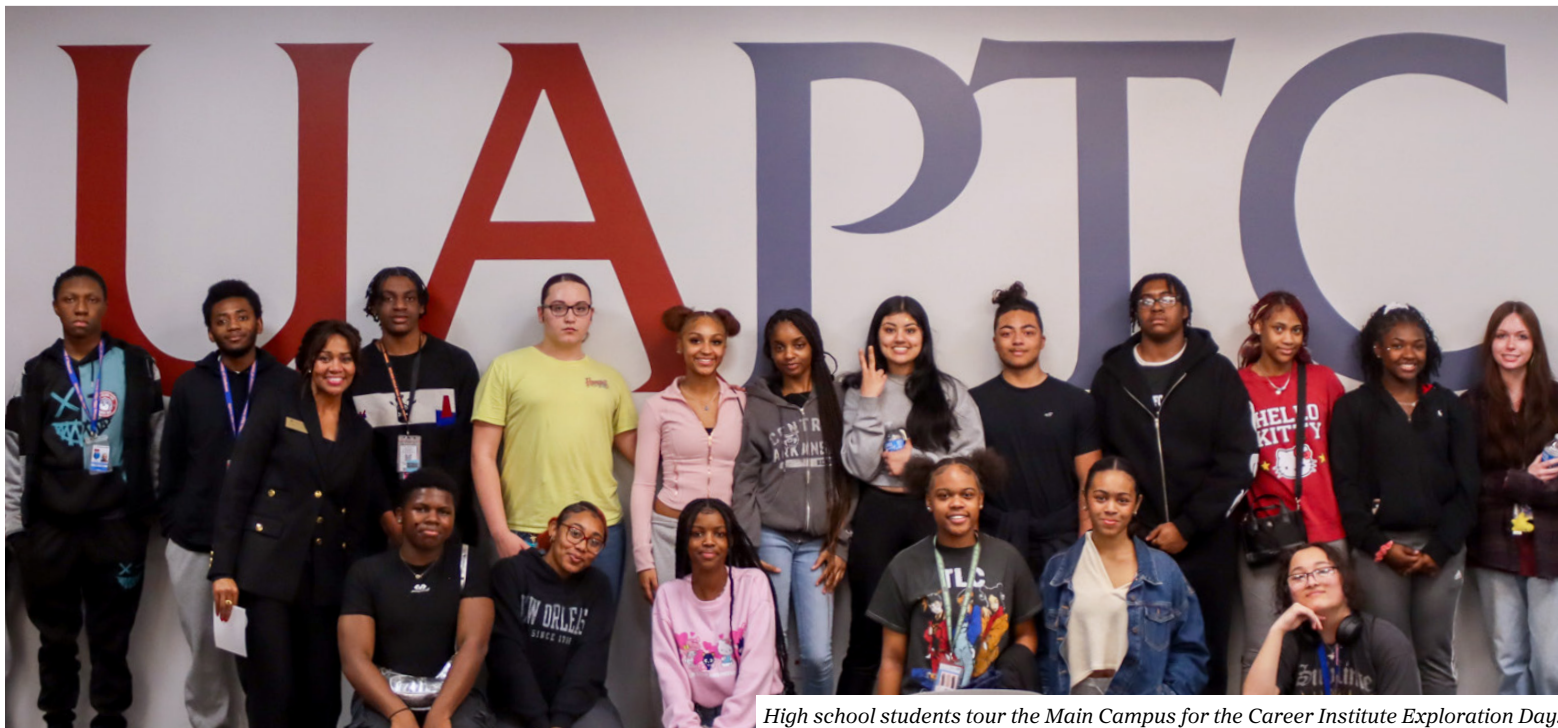
High school students tour the Main Campus for the Career Institute Exploration Day.

U A - Pulaski Tech saw an 8% increase in student headcount compared to Spring 2025, as 2026 Spring Semester enrollment numbers were updated to include the second eight-week semester. The total student headcount is 4,917, which includes the 16-week Spring Semesters and two eight-week semesters.