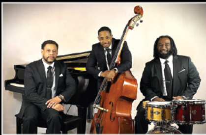
Enjoy the music of Pattern Blu