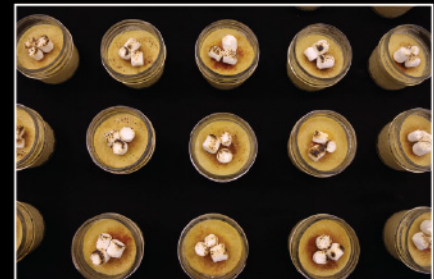
Sample treats from UA-PTC's Culinary School

Watch the 2026/27 Season Announcement Teaser